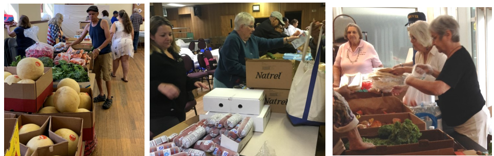
Volunteers distribute food in three food pantries serving clients affected by the gas crisis (from left to right—198 S. Broadway, Lawrence, 297 South. Union in Lawrence & Andover Senior Center)

out gas. The crisis also exposed a number of barriers our clients in the affected areas face in cooking the food we provide them. Even with the recovery efforts, some of our clients are still struggling and must choose between purchasing food or diapers instead of small appliances or tools that would make cooking easier. Others have been permanently relocated and need help with basic kitchen tools in their new residences. In May of this year, Neighbors in Need was awarded a $30,000 grant from the Essex County Community Foundation to help remove these cooking barriers and to bring more food to our 3 food pantries in the gas impacted areas. After completing a survey to better understand the range of issues and interest in assistance, we will use grant funds to provide more food and to distribute small appliances such as crock pots, toasters and blenders to clients at these pantries. We will work with a nutritionist to develop new recipes using food available at the pantries and to start a cooking club or to hold cooking classes. We believe this assortment of resources and tools will help our clients make better use of the food we serve and move forward more quickly in the recovery process.